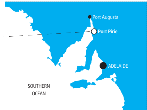
Port Pirie, South Australia