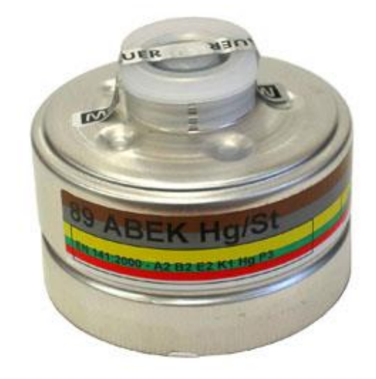
Figure: Example of a filter bus with encodings (color band, letter and class)

The combination filters are not classified.